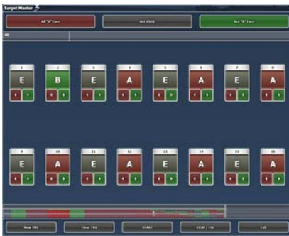
Target View with 16 Targets

The TargetMaster software allows moving, pop-up or turning targets to be controlled manually using the mouse or with a simple timer for basic shooting practices. More complex training requirements are catered for in Program Mode where targets are controlled by a scripted sequence which is 'programmed' by the operator and may be saved to hard disk in a library of training sets.