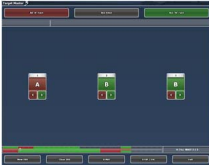
Target View with 3 Targets

Many indoor shooting ranges contain legacy mechanical targetry systems with very limited control. The mechanics of the target continue to operate, but the computer/electronics/remote control are problematic and can't be repaired. Sound familiar??